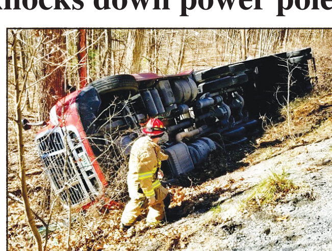
This tractor trailer overturned on Blood Mountain just before making it across the Union County line on Jan. 9, 2019, taking out a powerline in the process.

Lumpkin County See Tractor Trailer, Page 3A